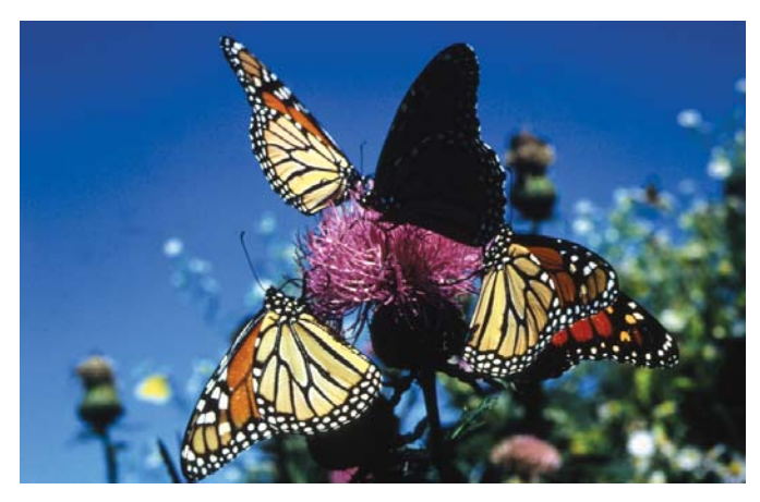
Biodiversity includes all organisms, from bacteria to complex animals.

Strong institutions at all levels are essential to support biodiversity conservation and the sustainable use of ecosystems. International agreements need to include enforcement measures and take into account impacts on biodiversity and possible synergies with other agreements. Most direct actions to halt or reduce biodiversity loss need to be taken at local or national level. Suitable laws and policies developed by central governments can enable local levels of government to provide incentives for sustainable resource management.