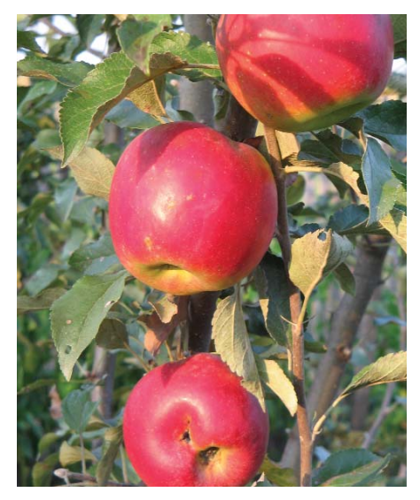
Biodiversity provides services and raw materials for human well-being.

Direct and indirect drivers of biodiversity loss must be addressed to better protect biodiversity and ecosystem services. Possible actions include eliminating harmful subsidies, promoting sustainable intensification of agriculture, adapting to climate change, limiting the increase in nutrient levels in soil and water, assessing the full economic value of ecosystem services, and increasing the transparency of decision making processes.