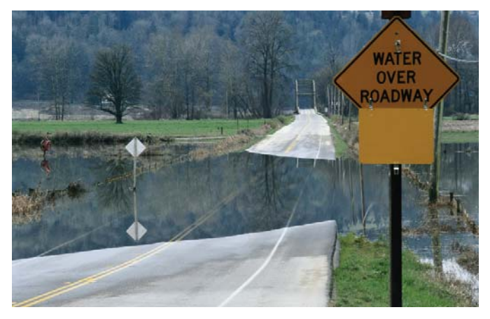
Biodiversity loss increases our vulnerability to natural disasters.

Over the last century, some people have benefited from the conversion of natural ecosystems and an increase in international trade, but other people have suffered from the consequences of biodiversity losses and from restricted access to resources they depend upon. Changes in ecosystems are harming many of the world's poorest people, who are the least able to adjust to these changes.